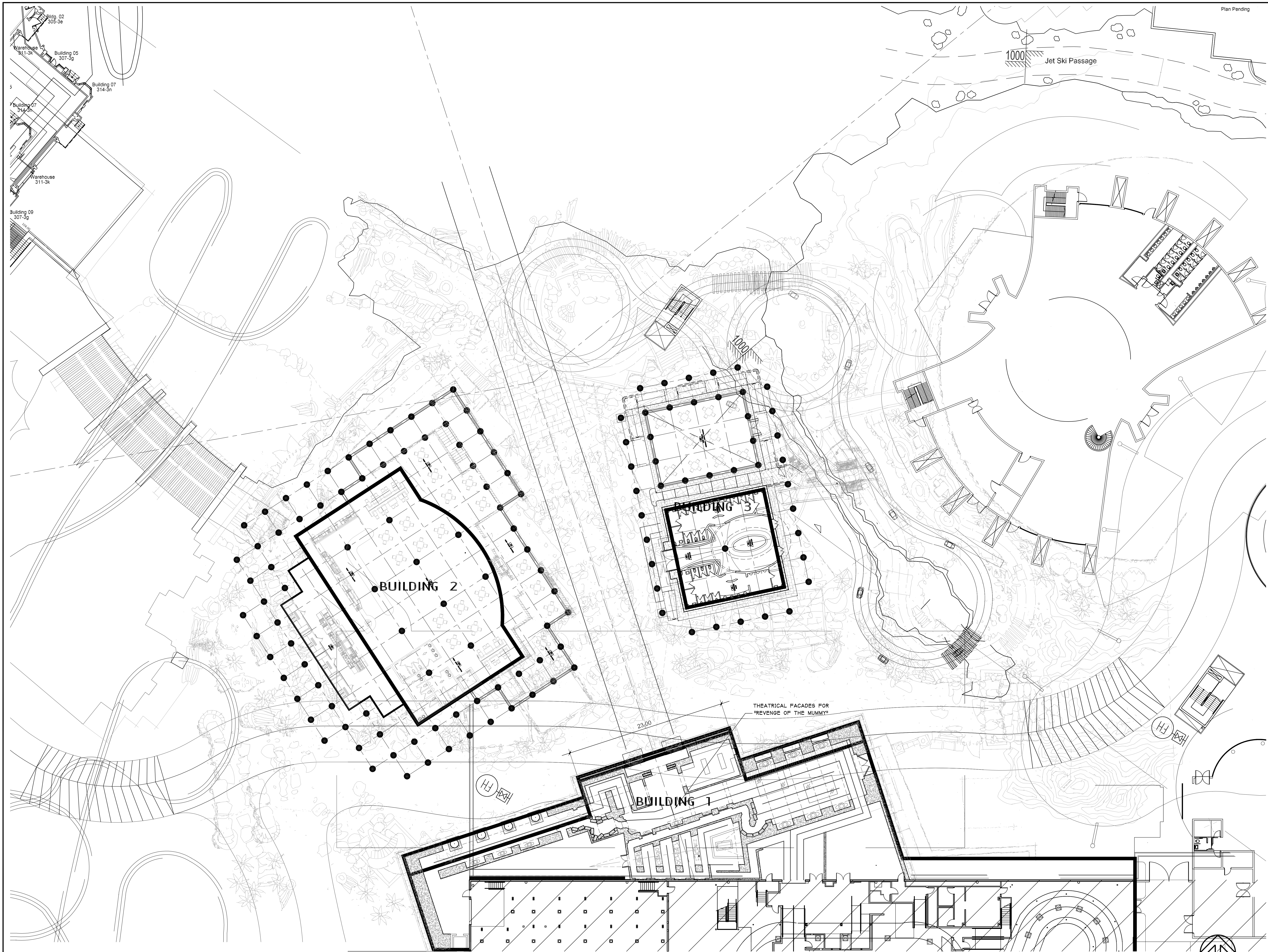
B EGYPT ZONE MASTER SITE PLAN SCALE = 1 : 200